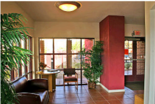
Public areas within the building include a lobby, a manager's office and 1,000 sq. ft. community room with full kitchen.